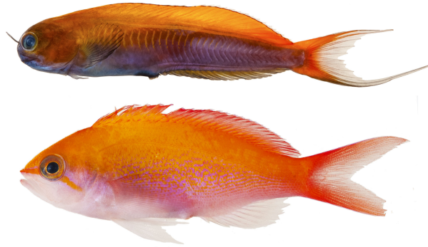
Figure 3: (b) Pseudanthias regalis and (a) its mimic Ecsenius midas .

relationships between multiple species). Because this complex mimicry case was only discovered from photographs rather than in-situ observations, the function of the complex is unknown. Stethojulis marquesensis may display this colour as a cleaning signal or for protective mimicry as cleaner species are less vulnerable to predation.